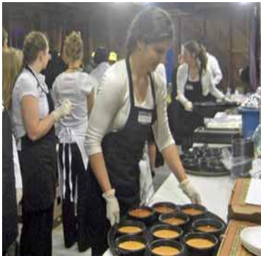
CHS Honor Society Serving dinner