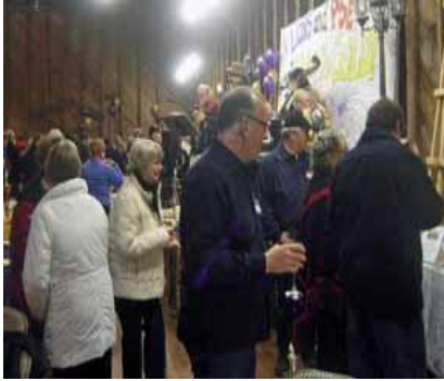
Keeping warm at the Auction

March is coming in like a Lion! Just had a 52 MPH gust of wind and rain predicted for the next several days. Congratulations