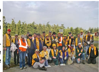
The Coupeville Lions Pickup Team

Adopt-A-Hwy litter pickup will be on Saturday, March 5, at 9:00am, in front of the Superintendent's office. We will not need as many litter pickers this time. Someone did the litter pickup on the east side of the overpass.