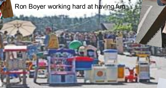
The Crowd is Ready!*