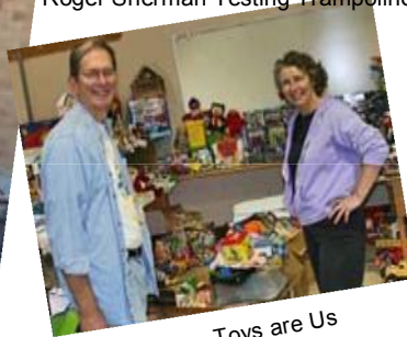
Toys are Us