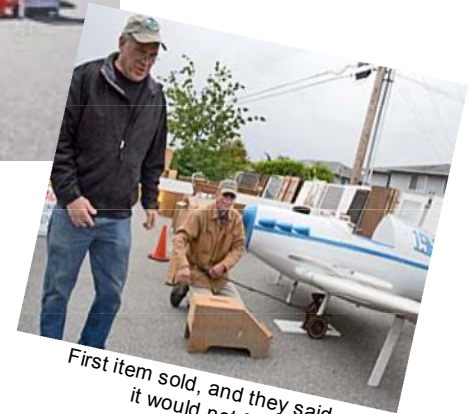
First item sold, and they said it would not fly