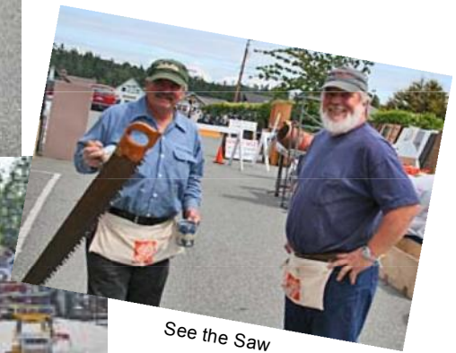
See the Saw