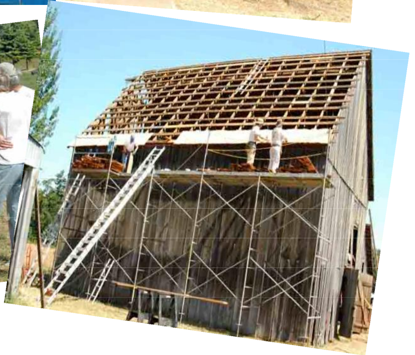
Restora- tion of the Boyer Barn Circa 1860