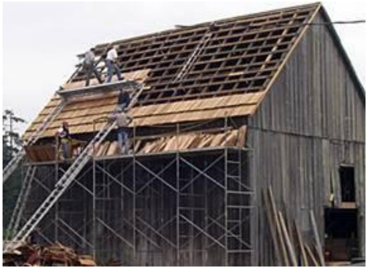
Nailing hand split cedar shakes on the 1860's Boyer Barn

I want to thank the Preservation Crew members that worked long and hard --and often under difficult work conditions badgered by Lion Joe Hillers and Lion Karen Fletcher -- while hanging from scaffolding, climbing ladders that never seemed to end, splitting shakes, restoring the barn doors, placing in the dutchman , figuring and installing the cable system to cinch up the building, and the pulley system to haul up shakes, pitching straw out of the barn and into the farm truck, nailing shakes, or delivering shakes or assembling shake kindling bundles, or clearing the site, or one of the many other chores as part of this impressive preservation project.