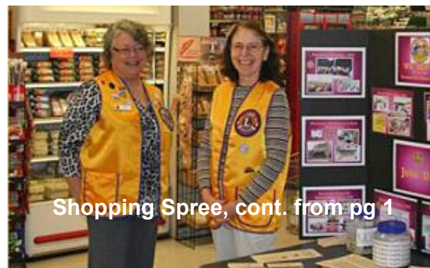
Shopping Spree, cont. from pg 1

fundraiser. Additionally, over $1270 was added to the Coupeville Lions Foundation which, as you know, supports many other local causes. From my point of view, this event is well suited as a starter job for any new Lion to head. I enjoyed learning "on the job" how to organize a schedule, recruit willing Lions, and count vast numbers of small bills. I also learned "at a dead run" that 1500 tickets are insufficient against the selling power we Lions possess and the kindness of our citizens who all dug extra deep this year. I have no doubt that the 2011 Shopping Spree will surpass all previous expectations. By the numbers: