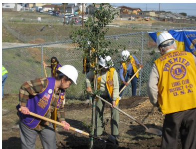
Lion plant Trees!