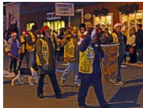
Lions on Parade in Coupeville