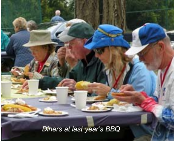
Diners at last year's BBQ

This is an event that supports community needs while providing a delicious dinner and social gathering.