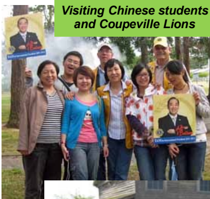
Visiting Chinese students and Coupeville Lions

Well, it looks like summer weather has finally come so enjoy the rest of the summer.