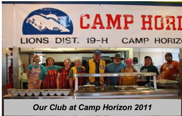
Our Club at Camp Horizon 2011

we faired pretty well and things will become more organized as we proceed.