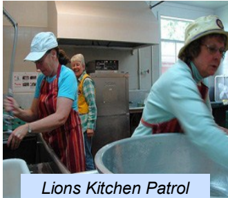
Lions Kitchen Patrol

The new year for Lions has started. We had a very busy Board of Directors and membership meetings.