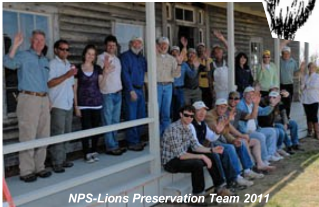
NPS-Lions Preservation Team 2011

The Coupeville Lions completed our 5th annual building preservation project on August 11th with a celebration BBQ at the Ferry House. Everyone was very happy and content; some were maybe even a little tired. We completed all that