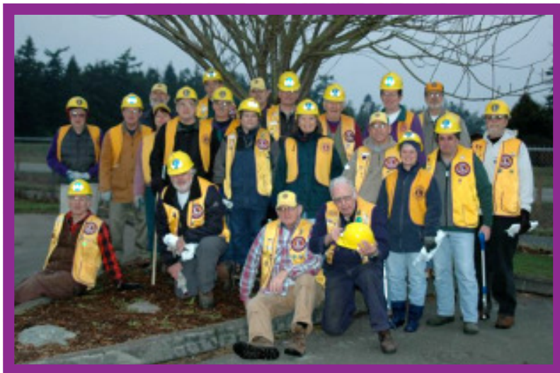
Adopt-A-Highway group. 23 members participated. Our largest turnout ever.