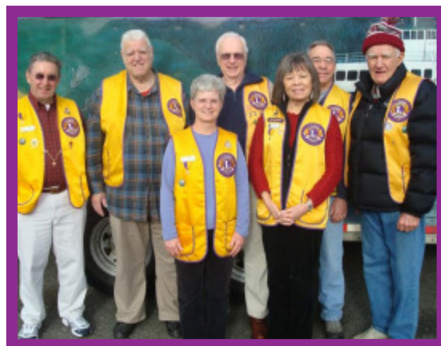
Just a few of our Lions who volunteered for the Sight & Hearing Van Duty