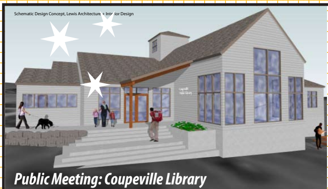
Schematic Design Concept, Lewis Architecture + IMV for Design Public Meeting: Coupeville Library