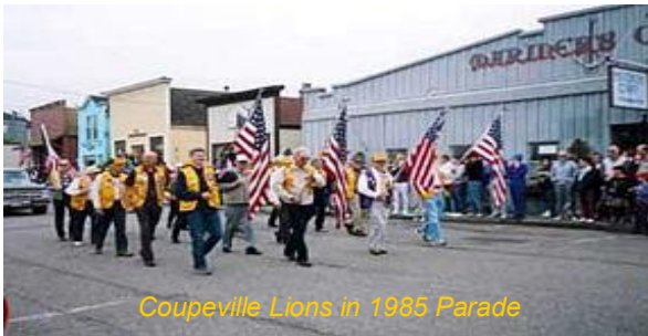
Coupeville Lions in 1985 Parade